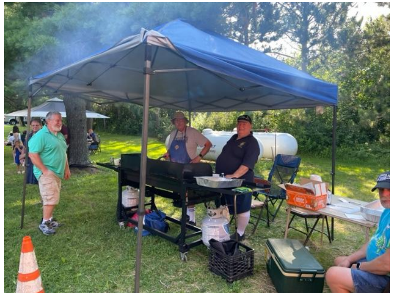
Knights Grilling at 2023 St. Paul the Apostle Annual Parish Picnic