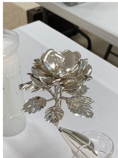
The Silver Rose

Please pray for our Armenian brothers and sisters in Christ during this time of persecution. For more info, please go to https://philosproject.org/savearmenia .