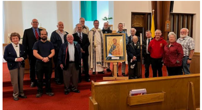
St. Joseph Icon Prayer Service

Thank you all for your outstanding service to our church and community!