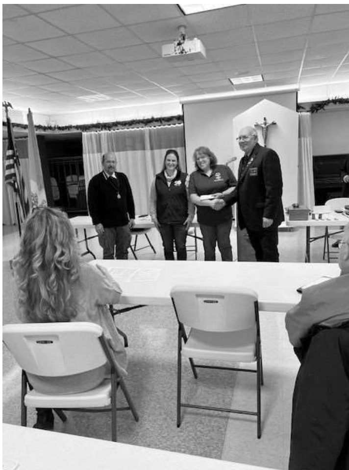
Special Olympics check presentation.