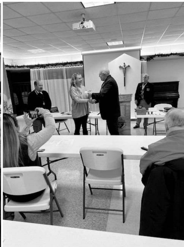
Camp Capella check presentation.